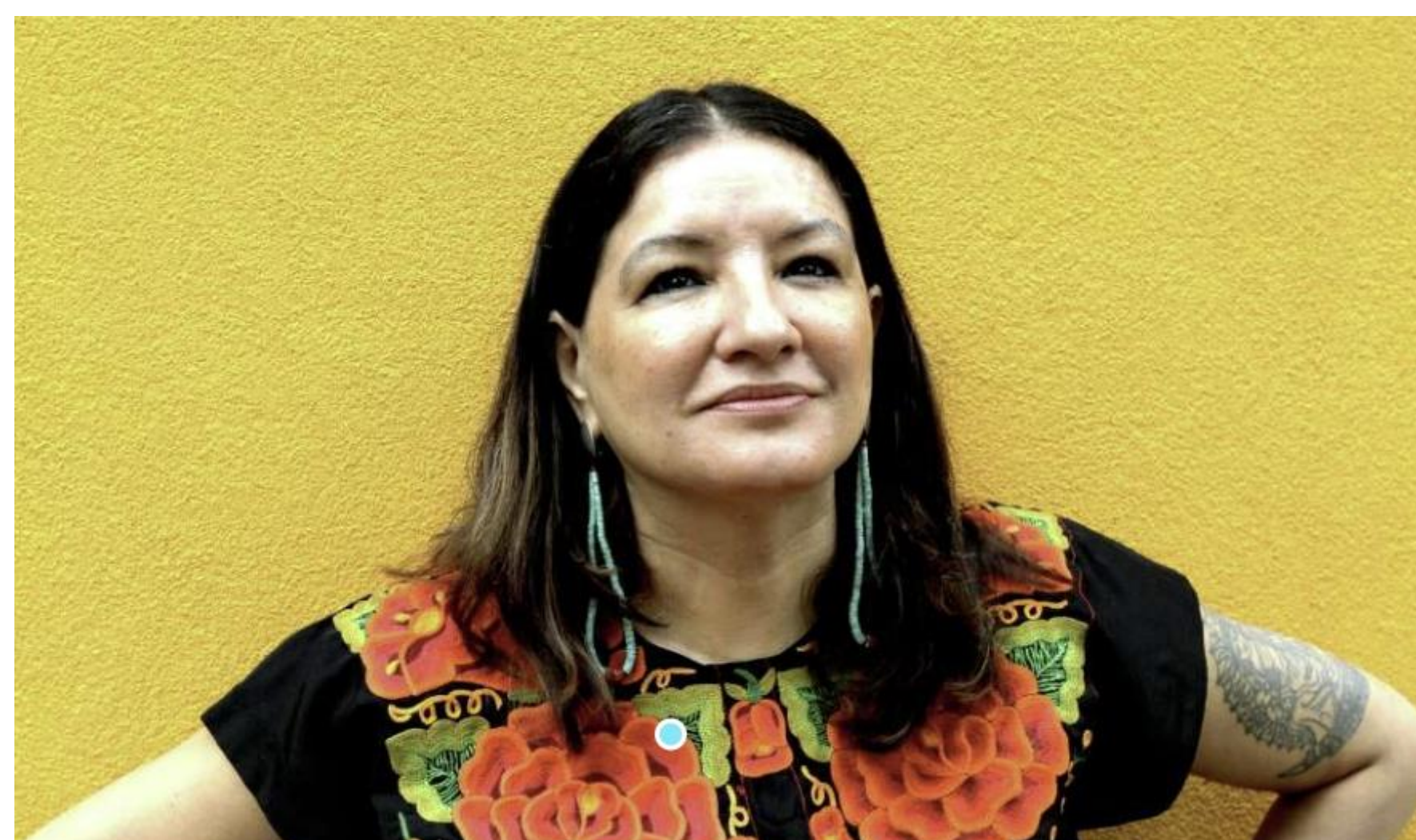
SANDRA CISNEROS: "I'm 62 and I feel like I'm not even halfway to being the chingona I want to be."