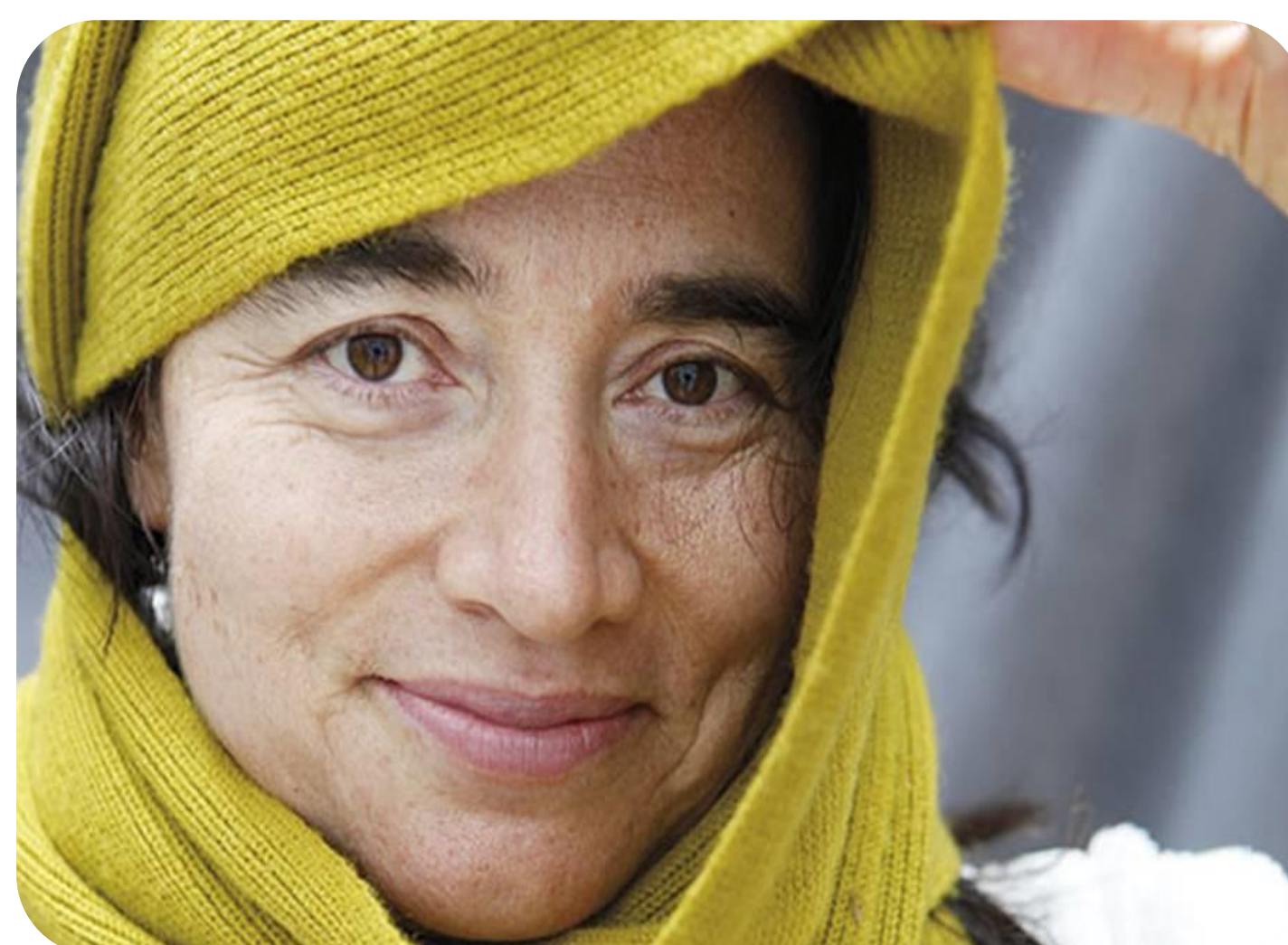
PATRICIA CARDOSO is the first Latina director in the National Film Registry. Cardoso's "Real Women Have Curves," starring America Ferrera, was among a handful of movies chosen for their cultural, historic and aesthetic importance to the nation's film heritage.

ABSTRACT. Two of the most distinctive features of foreign language education at UAM Iztapalapa are its interdivisional scope and its strong emphasis on the fusion of language-culture as our main pedagogical strategy. Our premise is that language learning in the public university should go far beyond the teaching of meaningless linguistic codes or trivial culture capsules in order to promote a critical understanding and respect of the cultural diversity of the peoples that speak those languages.